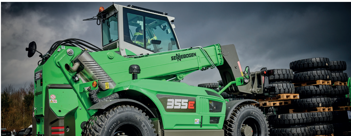
The new Telehandler 355 E from Sennebogen – good looks and first-class technology.

Either more torque for high lifting and pushing forces or faster driving speed. This solution optimally meets all requirements in materials handling.