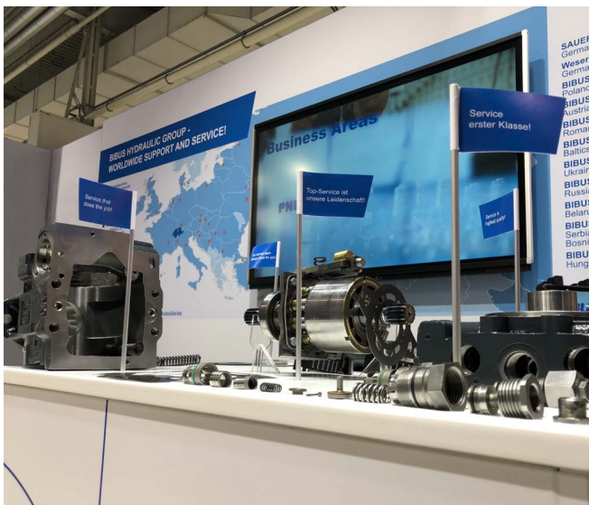
First class service by Sauer Bibus

“Our positioning at the fair as a solution provider corresponds to our self-image as a developer of innovative system solutions with a high degree of customer orientation, which always generate real added value for our customers. And this has already been very well received and confirmed in the first days of the fair via numerous concrete projects and preliminary agreements.”